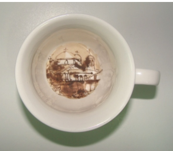
Artist: Tatiana Ferahian Title: Turkish Coffee, 2009 Medium: readymades, rice paper, ink and coffee

This work is meant to mimic the Middle Eastern art of Turkish-coffee cup reading, the origins of which stem from the ancient Chinese art of tea-leaves reading. Ordinarily, the patterns formed on the inside of the cup left by coffee residue is considered to hold visual symbols built up from our immediate culture and our root ancestry. The reading of these psychic insights is interpreted according to what they mean to the reader, which is usually based on part knowledge and part intuition. The art is still practiced and adopted by various seers from Greece, Cyprus, Persia, Turkey, Armenia, Serbia and many more.