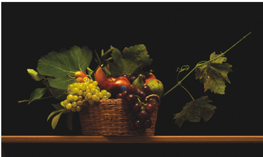
Artist: Marianna Constanti Title: Michelangelo da Caravaggio - Fruit Basket, 2009 Medium: mixed media

The "Still life" series make a direct reference to the still life paintings of the Renaissance period. "Still life" compositions are recreated with slight present-time intrusions. "Still life" explore a series of questions regarding identity, sense of belonging, novelty and co-existence in a frame where the significance of authenticity merges with a multi-meaning context in a super perfect manner. The importance of the once defined as different - uniquely imperfect therefore original - camouflages with the in- between meanings and exists in a world of "the not so bad imitations".