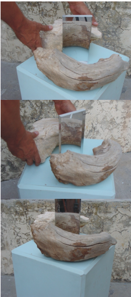
Artist: Sasa Savic Title: Mirroring the Other, 2006 Medium: a rock, a tree trunk and a mirror

Sasa Savic uses natural or found manufactured materials and assembles them into three-dimensional structures, often retaining their individual physical identity despite some slight artistic manipulation. In his work there is the notion of bringing together two opposites that mirror the complex interdependence of identity -- the desire for individual perfection and for the connected whole. He uses the mirror concept to split off the subject from the object, creating such paradoxes as Self and the Other, same and different, true and false, positive and negative, surface and depth. Yet within the interplay of this stage, one entity continues to build its self image, oscillating between its own reflection and the fragments of the Other, between the constructions of personhood, and one's place in society; and the other-world it inhabits.