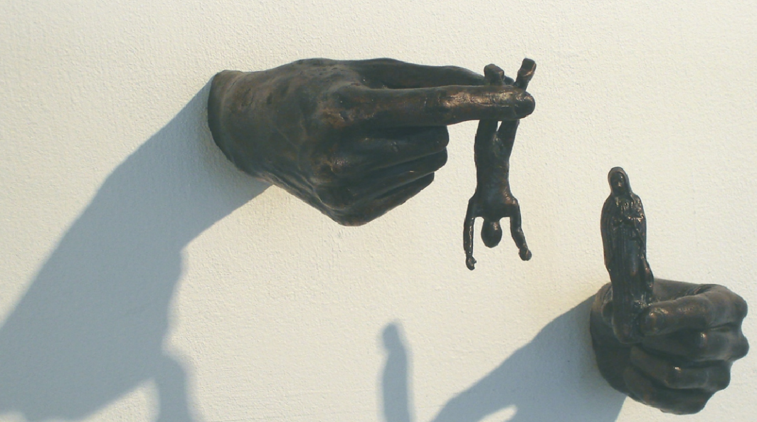
Artist: Matti Kalkamo Title: Hour of Prayer, 2006 Medium: bronze

My receipt as a sculptor: My purpose is to make art which, instead of being predigested, is hard to devour and takes a long time to digest. As for materials, I am omnivorous. In addition to bronze and aluminium I accept anything discarded, found and collected. First you take some pain spots of the existence or the world and throw in a hefty quantity of biographic matter. Add a good handful of scepticism and positive attitude towards life. Mix in some viewing experience with rapidly changing proportions. A spoonful of absurd humour – and the concoction is about ready!