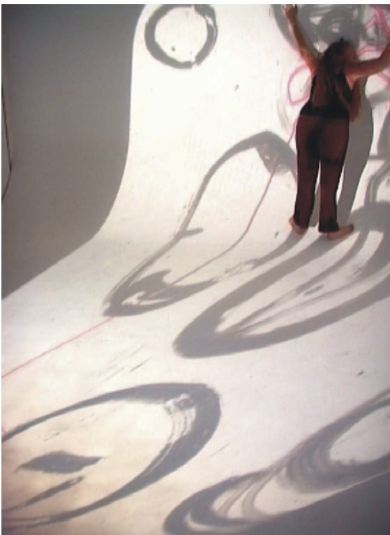
Artist: Christina Papakyriakou Title: Out-of-body experiences, 2009 Medium: multimedia

Exploration of live movement into a space that is overlapped by projection of images of "Here and Now". Live drawings that create illusive spaces and how they can allow our movement to be free by creating the space which we move inside, inspired from the interaction of the projected drawings.