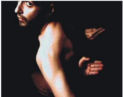
Artist: George Petrou Title: Gesture One, 2008 Medium: video still

Live performance filmed by - on body - video camera. The video shows the interaction of the performer's reactions to projected drawings. It gives to the spectator an idea on how a space can change from bodily movements and from different perspectives.