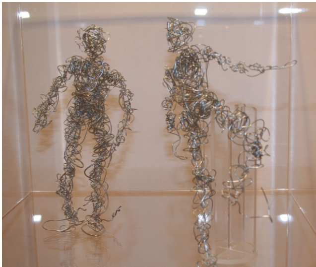
Artist: Julia Georgiadou Title: Untitled, 2008 Medium: metal wire

Straight line, zigzagged line, curved line, gross line, time line, horizontal line, start line, dead line, border line, offensive line, defensive line, life line, and so many other lines. I believe that everything around us is formed by lines. Sometimes they become visible through all the creations that have shape, form or figure and sometimes they explain a circumstance or even a point in time. It is easier said than done to try to entangle your work with lines. Working with lines you start considering lines as a fact of life or as your life's fact. Without even realizing you may find yourself painting a prison of feelings and thoughts. Whatever we may say now, or whatever we try to change, every "line" can exist on a different dimension in time. Since everything that we are surrounded with is of lines, I build and compose my work in that way. Based on lines and linear marks, I try to create some shapes and figures, which in fact do not exist in reality but they exist just like lines (or vise-versa). A figure, and/or, a shape, that is presented can be composed by infinity of points (a following of pointillism). The existence of the lines make the structure of the figures disappear, so new born aspects and/or concepts are created, that can be translated differently by each one of us.